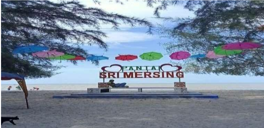
Figure 1. Mersing Beach