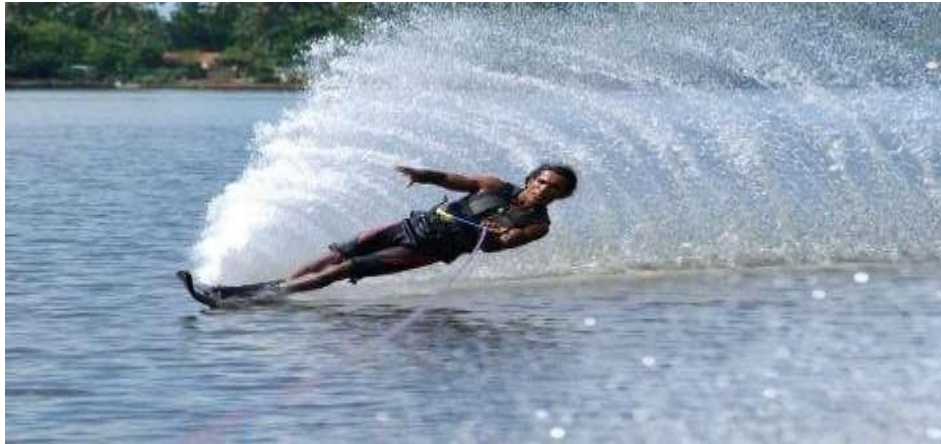
Figure 2. Watersport

preserving and developing Mersing Beach voluntarily. At that time, the community was led by the elders, and the village head coordinated with the Tourism Office of Serdang Bedagai Regency. The residents living around Mersing Beach cleaned the surrounding beach. The purchase of materials was self-funded by the community. Since then, the beach has been managed by the community itself, albeit with limited facilities and a relatively small number of tourist visits.